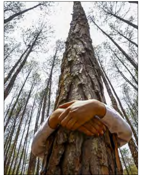
A Nepalese man hugs a tree while celebrating World Environment Day at the forest of Gokarna, on the outskirts of Kathmandu, in 2014.

11. What was the attitude of Jesus toward creation (96-100)?