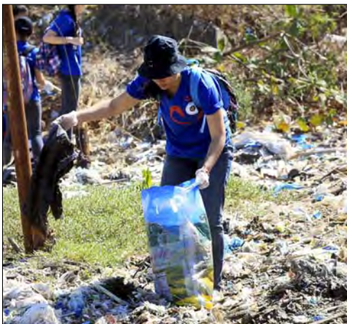
A volunteer picks up trash at Freedom Island, a marshland considered to be a sanctuary for birds, fish and mangroves, in the Philippines in April 2015.