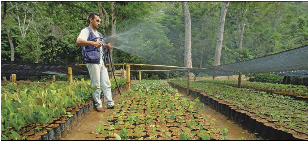
A reforestation nursery in Montes Claros, Brazil

One of the many marvelous things about Pope Francis' encyclical on the environment, " Laudato Si', on Care for Our Common Home ," is that it is written in a very accessible style. It does not read like an academic tome as have many encyclicals of the past. Anyone who can read a newspaper can read this encyclical and get something out of it.