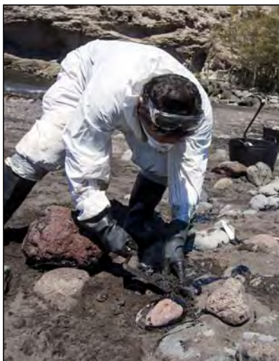
A man collects fuel oil from rocks in April 2015 following an oil spill along Veneguera beach in Spain's Canary Islands.

3. Why does Francis think it is important for us to understand ecosystems and our relationship