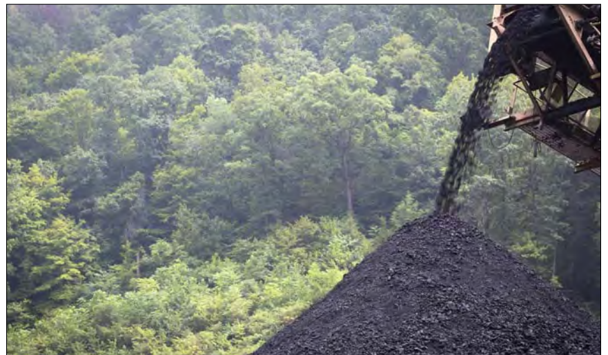
A mound of coal after being processed near Whitesville, W.Va., in August 2014