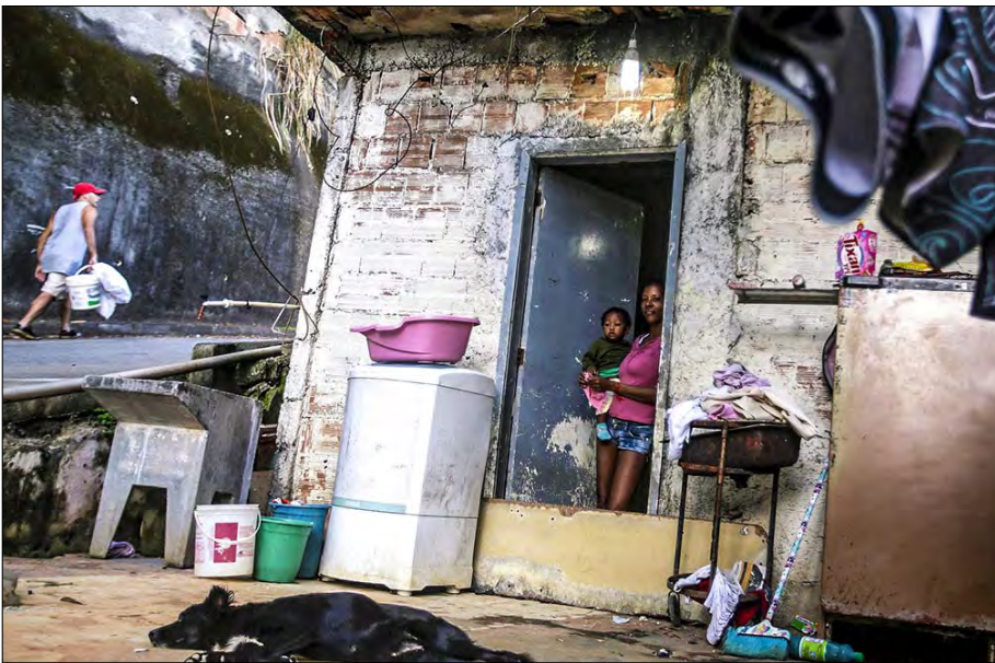
A woman holds her child at the entrance of her house in a slum area of Rio de Janeiro in April 2013.

10. What does Francis see as the positive and negative aspects of biological technologies (130-136)?