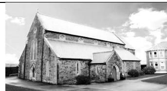
St Bridgid's Church Duagh