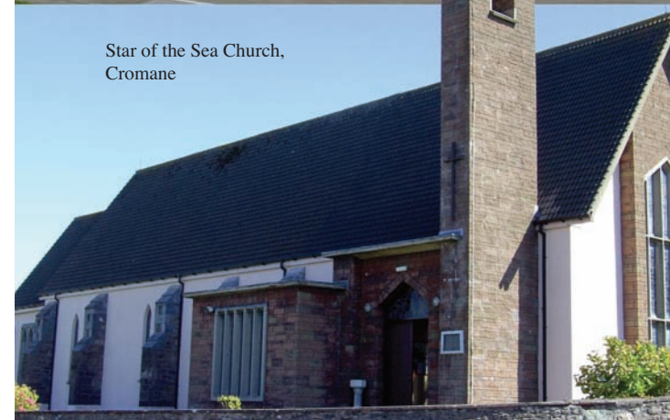
Star of the Sea Church, Cromane